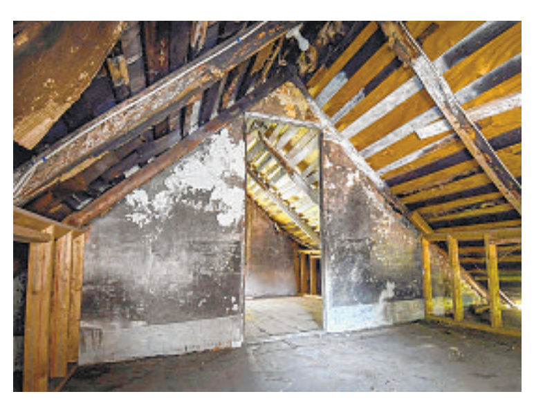
The upstairs of this log cabin, which dates from the 19th century, will be part of the restoration to turn the building at 417 Jonathan St. in Hagerstown into affordable housing.

he discovery came through trauma. On a wet evening in 2018, a patrolman with the Hagerstown police crashed his cruiser into 417 Jonathan St., a tiny house at the center of the city's historic African American neighborhood. The house was condemned; its elderly owner went to live elsewhere. When the demolition crews arrived and began to rip off the vinyl siding, they saw horizontal timbers, still bearing the ax marks of the person who hewed them from tree limbs perhaps 200 years ago.