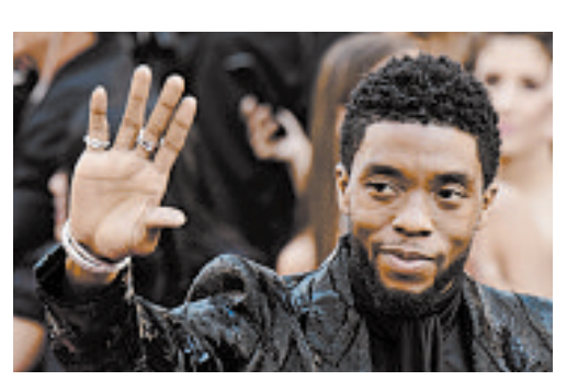
Chadwick Boseman, 43, who died Friday, was diagnosed with colon cancer four years ago.